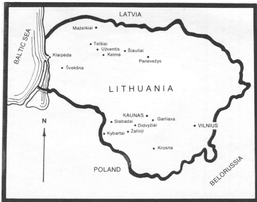
Places mentioned in the CHRONICLE OF THE CATHOLIC CHURCH IN LITHUANIA NO. 38