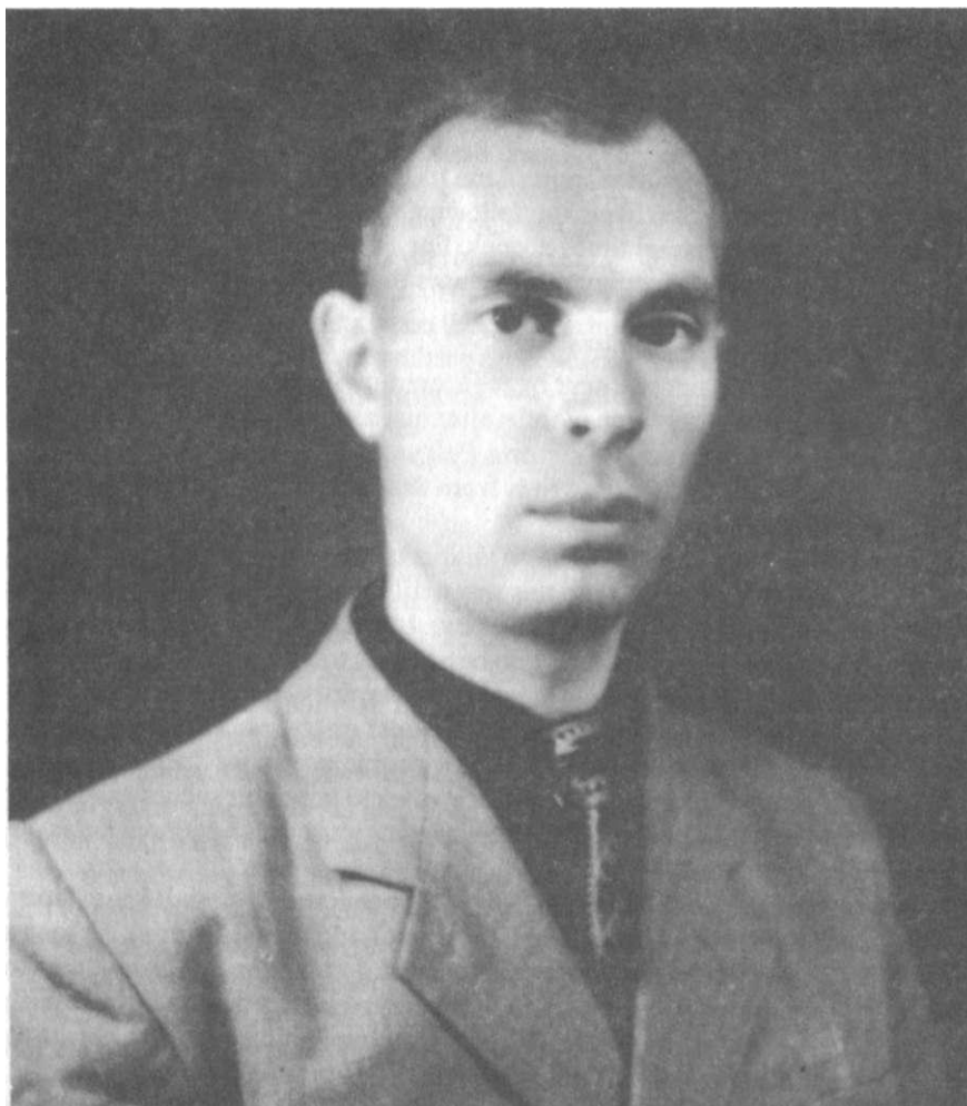
Viktoras Petkus as a student and Catholic activist.